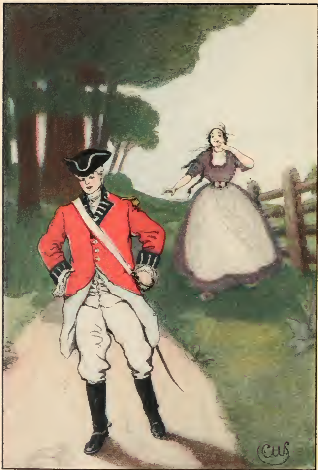
Frontispiece—When the British Came.

"HE WAS GONE, WITH BOWED HEAD AND NEVER A BACKWARD LOOK."